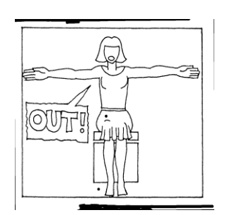
SHUTTLE IS OUT